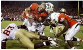
What is a concussion?