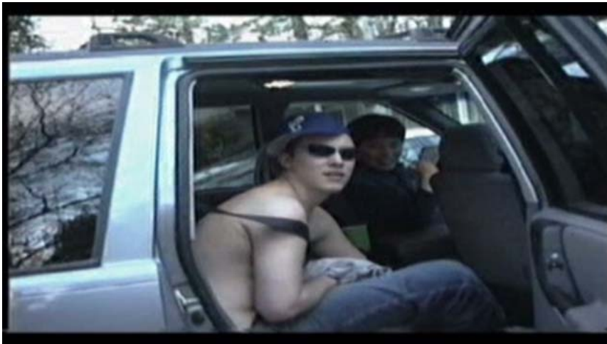
The impact of a concussion